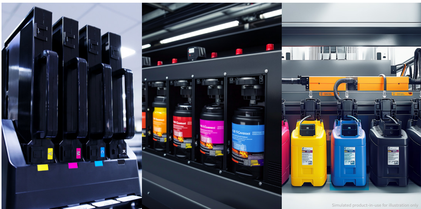
Simulated product-in-use for illustration only

Inks | Dispersions | Contract manufacturing